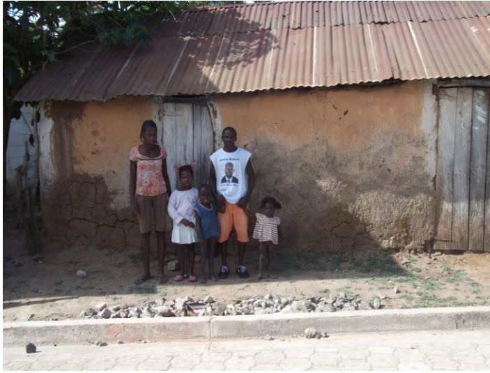
Old family Toilet