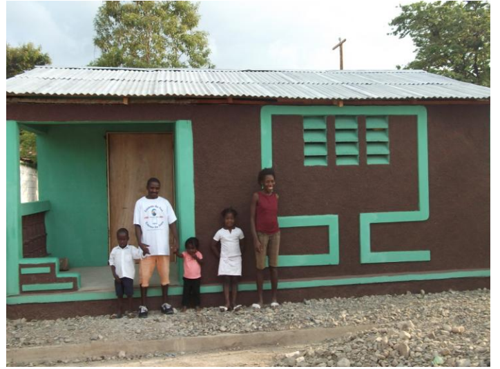
New family Toilet